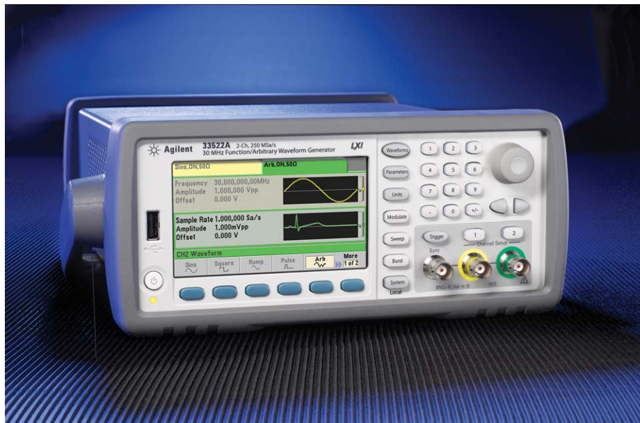
33522A Function Arbitrary Waveform Generator

Revolutionary signal generation delivers the highest signal fidelity in its class, full-bandwidth pulses and real point-by-point arbitrary waveforms