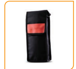
U1175A Carrying case

For full listing of accessories compatible with U1210 Series, visit www.agilent.com/find/clampmeter