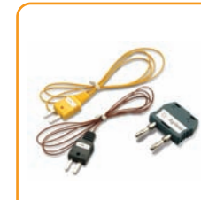
U1180A Thermocouple adapter/lead kit