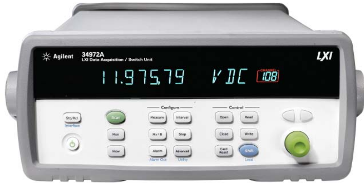
Figure 1. Agilent 34972A Data Acquisition/Switch Unit

The 34970A/34972A Mx+B scaling feature can then be used to convert the current reading to relative humidity. The 20-channel multiplexer module also has two fused current input channels for measuring current directly (no shunts) if needed. Alarm limits can be set and a TTL alarm output bit can be wired to the control system to indicate if the temperature inside the chamber exceeds a maximum value. A PC is connected to the 34970A/34972A to monitor and record the necessary data.